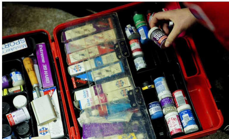
VIL TIL RETTEN: Smurningsprodukter med fluor kan bli totalt forbudt i neste uke. Hvis så skjer vil smurningsfabrikantene gå til erstatningssak mot FIS.

13 smurningsfabrikanter vil gå til erstatningssøksmål på 100 millioner kroner hvis FIS innfører sitt varslede forbud mot fluor.